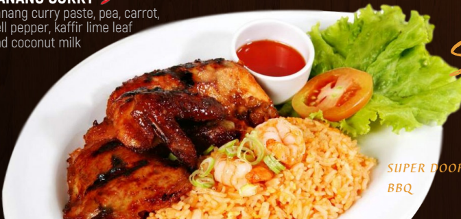
SUPER DOOPER BBQ