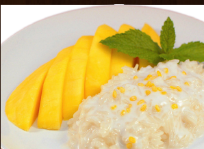
MANGO WITH STICKY RICE