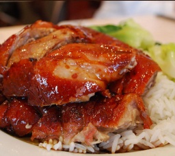
ROASTED DUCK OVER RICE