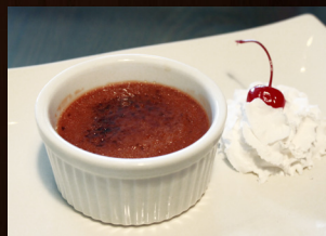
THAI TEA CRÈME BRULÉE