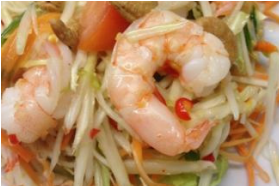
PAPAYA SALAD W/ SHRIMP